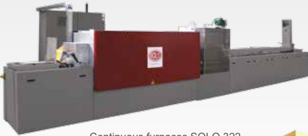
Continuous furnaces SOLO 322

Profitherm type batch furnaces. This unique, multifunctional arrangement of bell-type furnaces and multiple quench tanks, allows a direct & rapid transfer of the load from the furnace(s) to the quench tank(s). The modular design enables easy expansions and allows all types of atmospheres and quench media.