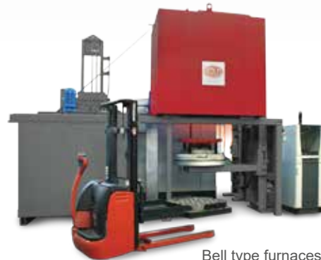
Bell type furnaces Profitherm