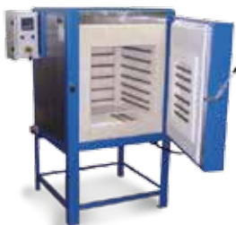
Chamber furnaces 800–1100 °C