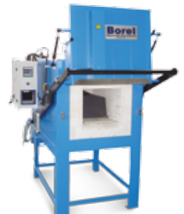
Chamber furnaces 1250 °C