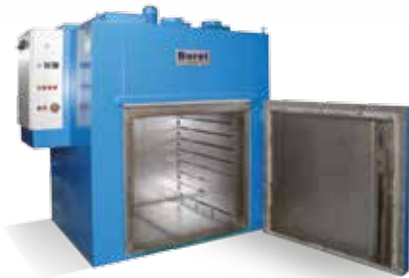
Industrial ovens 150–350 °C