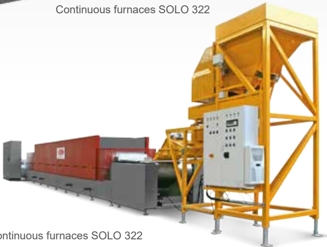
Continuous furnaces SOLO 322