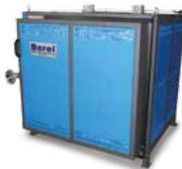
Industrial ovens 200–500 °C