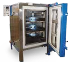
Industrial ovens 500–600 °C