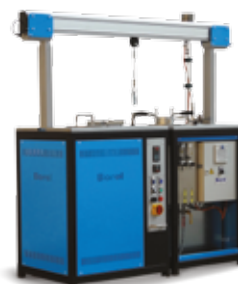
Atmosphere furnaces H_2/NH_3