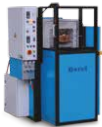
Heat treat furnaces with oil tank