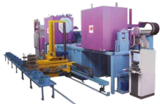
Automatic heat treatment lines